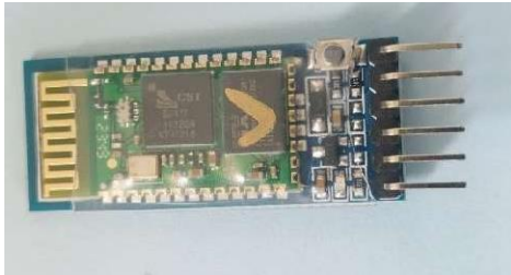
Figure 4. HC-05 Bluetooth

data received through the serial input is immediately transmitted over the air. When the module receives wireless data, it is sent out through the serial interface exactly at it is received. No user code specific to the Bluetooth module is needed at all in the user microcontroller program.