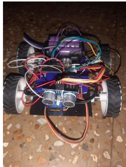
Figure 5. Result

First time I designed this model is different-different types of struggles in this paper. I kept the connections to the designed model according to the instructions which is given by me successfully [19]. Finally, this designed model can move the several directions and also it can move the robot car from one place to another place. I have tested this designed model many times and many places it performing tasks according to our requirements without any problems. I have designed this model to control user in long distances with the help of Bluetooth Module [19].