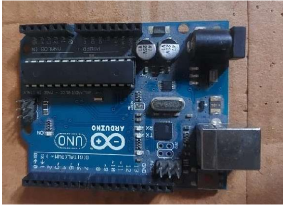
Figure 1. Arduino Uno R3

You can tinker with your Uno without worrying too much about doing something wrong, worst case scenario you can replace the chip for a few dollars and start over again [11].