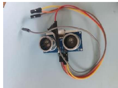
Figure 3. Ultrasonic Sensor

The HC-SR04 Ultrasonic Distance Sensor is a sensor used for detecting the distance to an object using sonar. It's ideal for any robotics projects you have which require you to avoid objects, by detecting how close they are you can steer away from them! The HC-SR04 uses non-contact ultrasound sonar to measure the distance to an object, and consists of two ultrasonic transmitters (basically speakers), a receiver, and a control circuit. The transmitters emit a high frequency ultrasonic sound, which bounce off any nearby solid objects, and the receiver listens for any return echo. That echo is then processed by the control circuit to calculate the time difference between the signal being transmitted and received. This time can subsequently be used, along with some clever math, to calculate the distance between the sensor and the reflecting object!