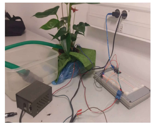
Figure 3: Result showing the working of the system

Below is the result of our experiment shown in Figure 3 in the form of the overall representation of our tested automatic plant watering system based on Arduino microcontroller and sensor technology. It can be concluded from the picture below that the system has been designed and successfully tested in a successful way. Also, functionality of the system along with overall behavior of the plant was observed in the next 30 days and was in results of good as was expected and wished. As a result of our observation, we found that the plant kept its homeostasis of the very desired, regular, healthy manner without any deficiency shown by the plant. Once the sensor detected a need for water, the microcontroller signaled the pump to begin watering the plant until it had delivered enough volume of water.