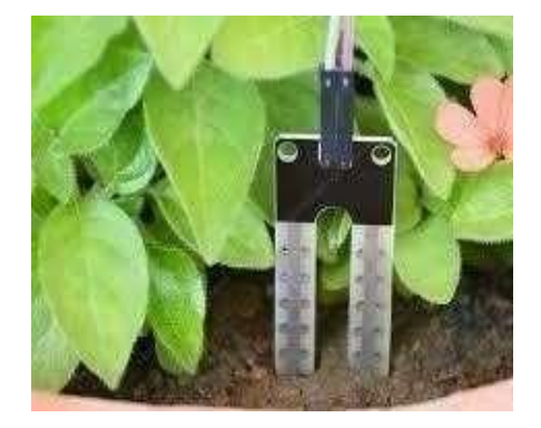
Fig :4.2 Soilmoisture sensor

Soil moisture sensors measure the volumetric water content in soil. Since the direct gravimetric measurement of free soil moisture requires removing, drying, and weighing of a sample, soil moisture sensors measure the volumetric water content indirectly by using some other property of