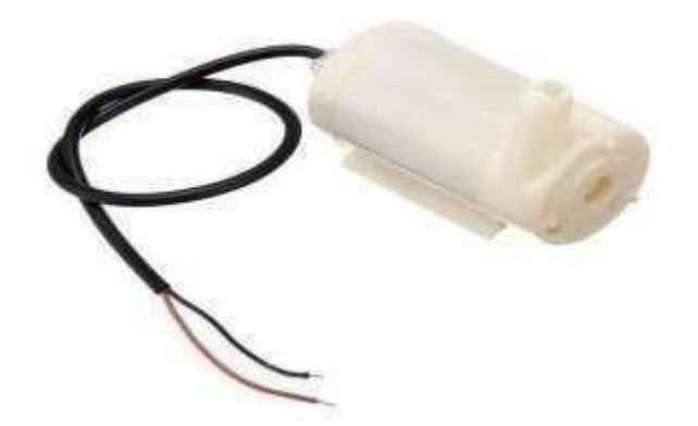
Fig:4.3 DC motor pump

the soil, such as electrical resistance, dielectric constant, or interaction with neutrons, as a proxy for the moisture content. 4.3 DC MOTORPUMP