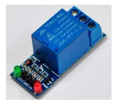
Fig: 4.4 RELAY MODULE

A relay is an electrically operated switch. It consists of a set of input terminals for a single or multiple control signals, and a set of operating contact terminals. The switch may have any number of contacts in multiple contact forms, such as make contacts, break contacts, or combinations thereof.