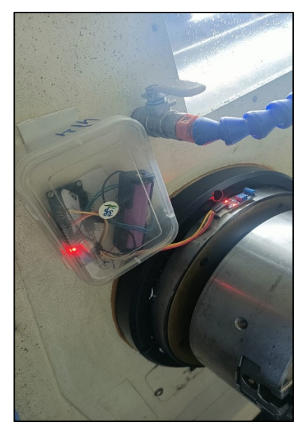
Fig. Vibration sensor mounting