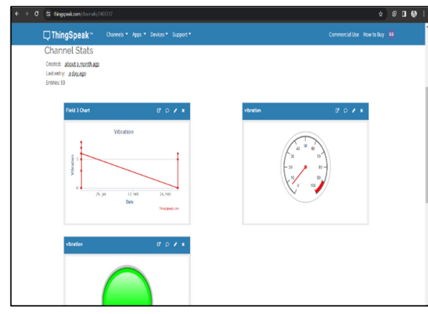
Fig. Thingspeak cloud dashboard of Vibration