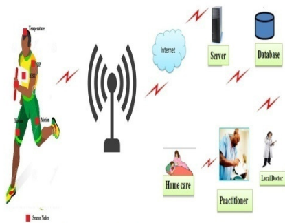
Example Scenario for Wireless Sensor Networks

embedded in the environment track the physical state of a person for continuous health diagnosis. So using this technology for monitoring the patients and get fitness of our body.