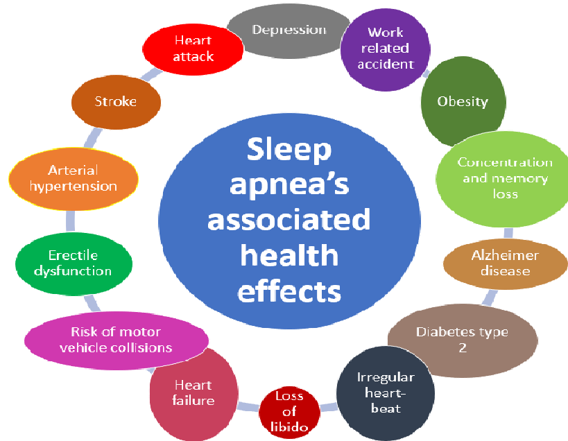
Figure 2 sleep apnea associated health issues

Another method of detecting the OSA has a home test involved by single-lead ECG, this method has been taken by the person who has the symptoms of OSA with a smartphone or other device like sensor will detect and store the pattern of breathing, limb movement, blood pressure, and snoring pattern