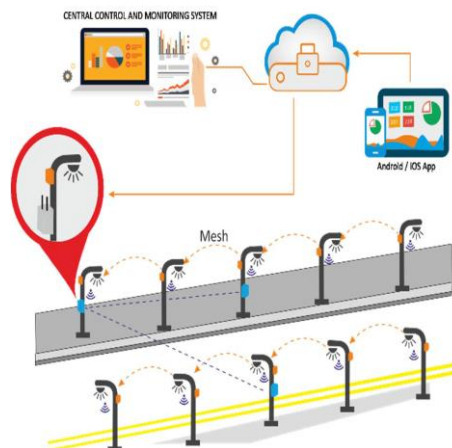
FIGURE 2. Proposed system of Smart Street light.

The system does not require manpower and periodic check instead the system status is continuously updated. It is also helpful in getting the accurate temperature and humidity condition of a specific area. smart system. Which shows the status of the LEDs, power usage, intensity of sun light, sensor threshold, Temperature and humidity. It has advantages such as user-friendly, all data access in a single window interface.